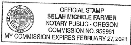
Notary Public-State of Oregon